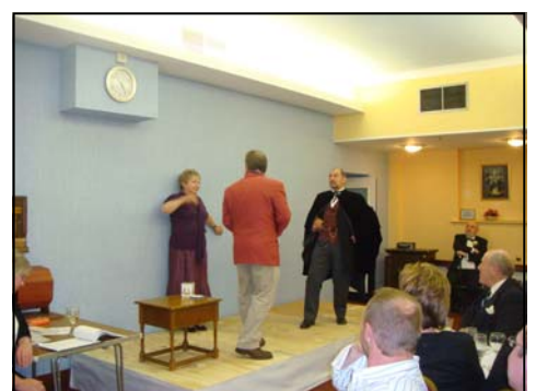
The WesterHAM Players