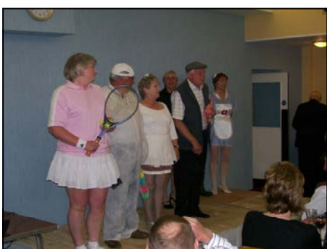
The Tonge Troubadours

Everyone went home feeling royally entertained, and with over £500 being raised by the event, it was a truly great start to the Festival for Sevenoaks.